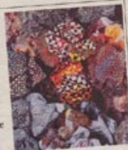
and executed in blue ballpoint pen. JA Modern Art Inc, E2, Friday 18 until November 24

the substance buckles and stretches in the heat. Once pliable, he fashions the material into sprawling sculptures that either sit squarely on the floor or climb up walls like delicate spaghetti strips of multi-coloured chewing gum. This solo show will also feature some of Dawson's Spirograph drawings made using the children's toy